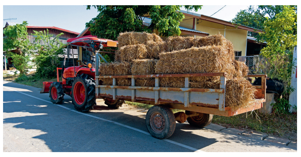
Transport of sugarcane bales for energetic use.